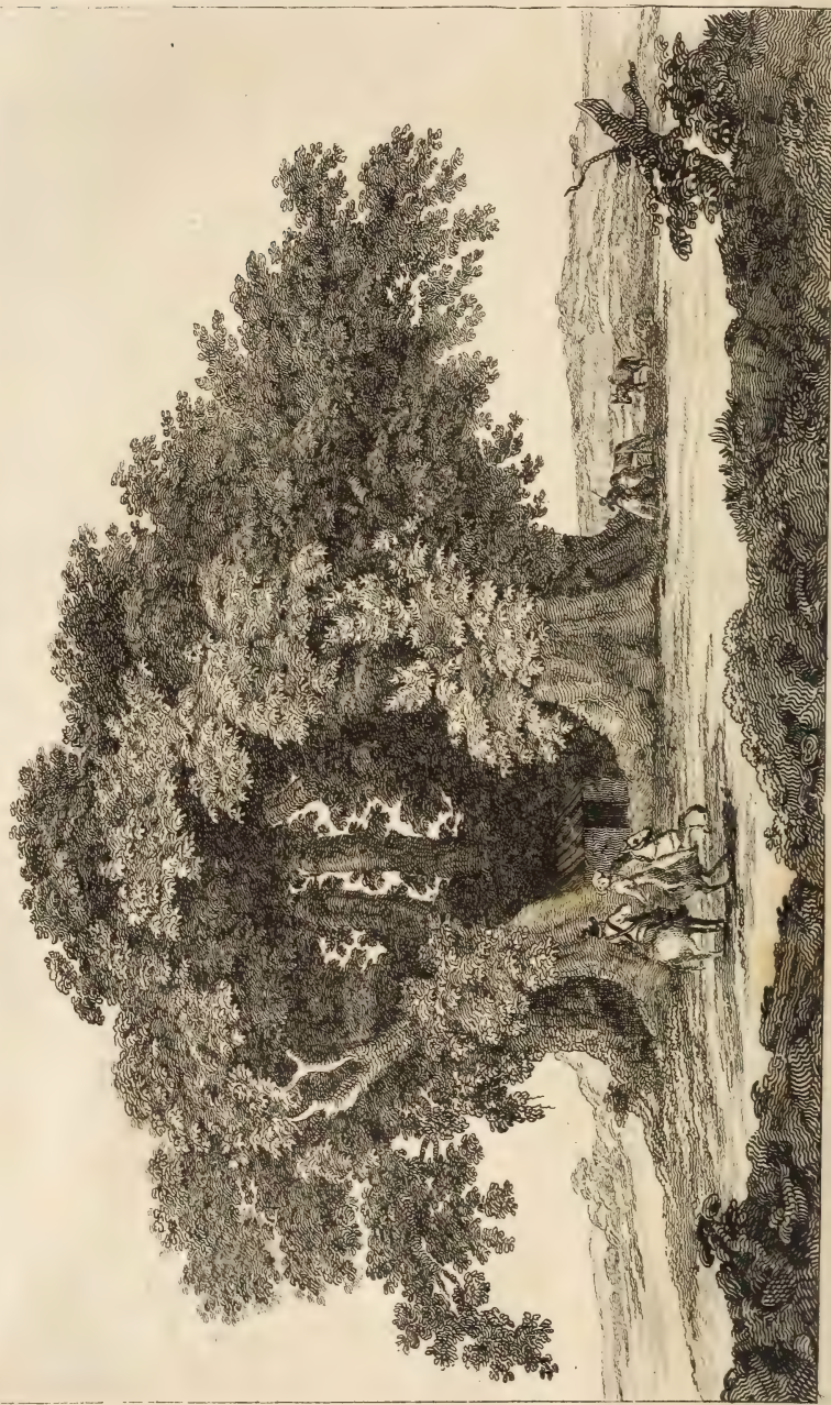
GREAT CHESNUT TREE ON MOUNT ETNA.

Engraved for Monticelli's Miscellaneous Reports of Woods & Plantations &c. &c.